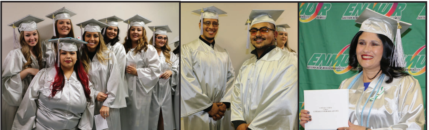
Proud candidates for graduation receive their diplomas on Thursday, December 8th at the Roswell Convention and Civic Center.