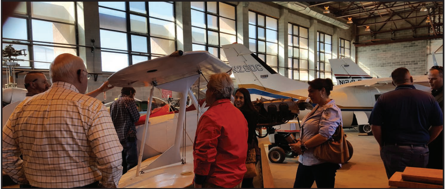
35 Leadership Roswell participants visited the different departments on campus.

On February 10th the Leadership Roswell class was able to experience the “real life” simulation equipment on campus which included the pilot training simulator in the Aviation Department, the CDL simulator, and the Regional Medical Simulation Center.