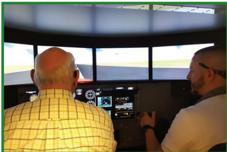
Pilot Training Simulator