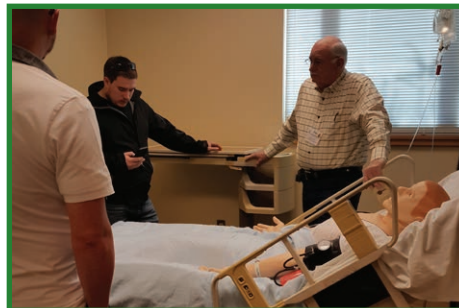
Medical Simulation Center