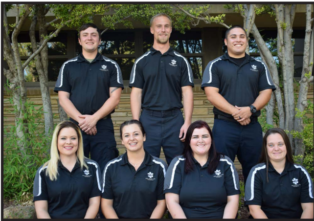
2017 Summer Paramedic Graduates

Eastern New Mexico University-Roswell's EMS Education Program's 52nd Paramedic Class graduated on July 28, 2017. These students spent 14 months of intense training in advanced patient assessment, pharmacology, and management of acute emergencies. Students spent approximately 600 hours in the classroom, 450 hours in clinical rotations, and 225 hours in internship.