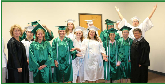
Special Services holds 32nd Annual Graduation

For more information on the Special Services Program, call (575) 624-7286 or visit them on the web at www.roswell.enmu.edu .