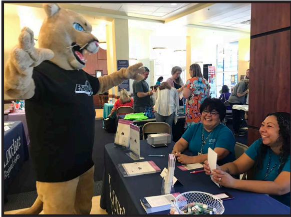
Cosmo visits with vendors at the Bump to Baby event at Lovelace Hospital

ENMU-R "COSMO" Cougar was a hit! Lovelace Regional Hospital hosted an event for expecting mothers in June. They had approximately 150 attendees, 26 vendors including Roswell's finest First Responders (RPD, RFD and Sheriff's Dept). Visitors enjoyed a BBQ with burgers and hot dogs, snow cones, popcorn, face painting, DJ and lots of fun, and information for moms and new moms-to-be.