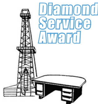
Roswell Desk and Derrick Club