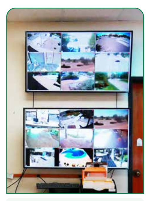
Improving the exterior lighting will also help provide better images for the planned exterior surveillance cameras, as well as save energy and reduce operational and maintenance costs.

and safety upgrades. ENMU in Ruidoso would receive $1.5 million for campus infrastructure improvements.