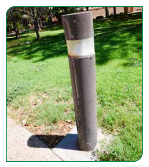
Light poles that are rusted and deteriorated and pose a danger of falling during a high wind event would be replaced using Bond C funds.

In Chaves County, approval of Bond C will mean an allocation of $1.85 million for ENMU-Roswell, which will fund needed upgrades to video surveillance equipment and exterior lighting. NMMI would receive $3 million for the renovation of roofs for Wilson Hall, Godfrey Athletic Center, and Toles Learning Center. ENMU in Portales would receive $8 million for phase one renovations of Roosevelt Science Hall