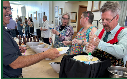
ENMU-Roswell staff enjoying ice cream at the social.