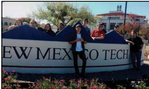
GEAR UP/Goddard HS ~ 11th grade students visit New Mexico Tech on Nov. 2.