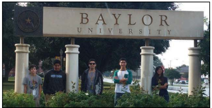
GEAR UP/Goddard HS ~ 11th grade students visit Baylor University on 11/10/15