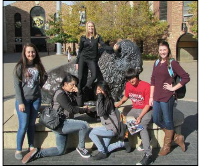
GEAR UP/Goddard HS students visit University of Colorado on Oct. 20.