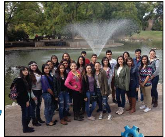
Roswell HS/GEAR UP students visit University of New Mexico on Oct. 7.