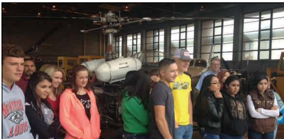
Hagerman 10th and 11th grade GEAR UP students tour ENMU Roswell on Oct. 8.