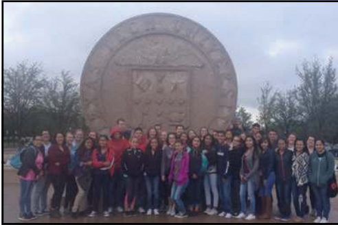
GEAR UP/Roswell HS students visit Texas Tech University on Oct. 21.