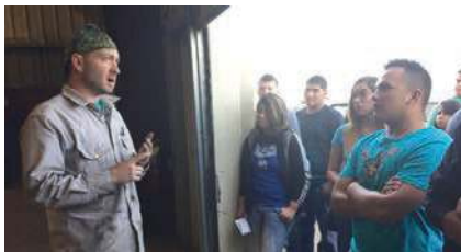
Dexter GEAR UP students visit ENMU Roswell for a CTE tour on Oct. 1.