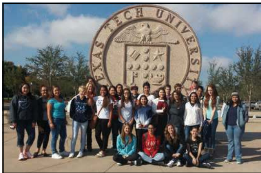
GEAR UP/Goddard HS ~ 10th grade students visit Texas Tech University on Nov. 4.