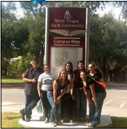
GEAR UP/Goddard HS students visit West Texas A&M University on Sept. 29.