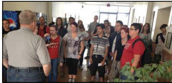
GEAR UP/Roswell HS students visit ENMU Roswell for a CTE tour on Oct. 20.