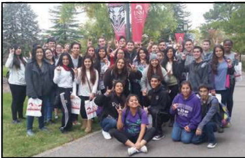
Roswell HS/GEAR UP students visit University of New Mexico on Oct. 29.