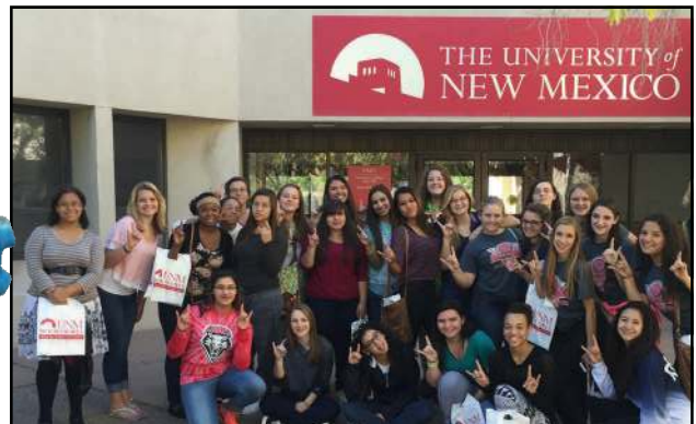
GEAR UP/Goddard HS ~ 10th grade students visit University of New Mexico on Oct. 27.