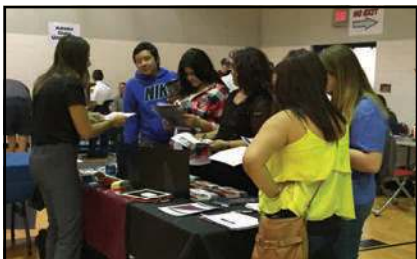
Dexter GEAR UP students visit a College Fair at NMMI on Sept. 19.